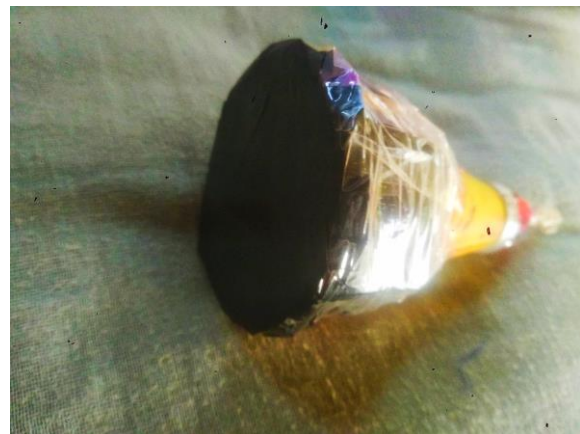
Figure 2: Its the Equipment which is a photo-electronic device name is Insoul-T

Which helps to chemical valance in body according ratio of energy in body